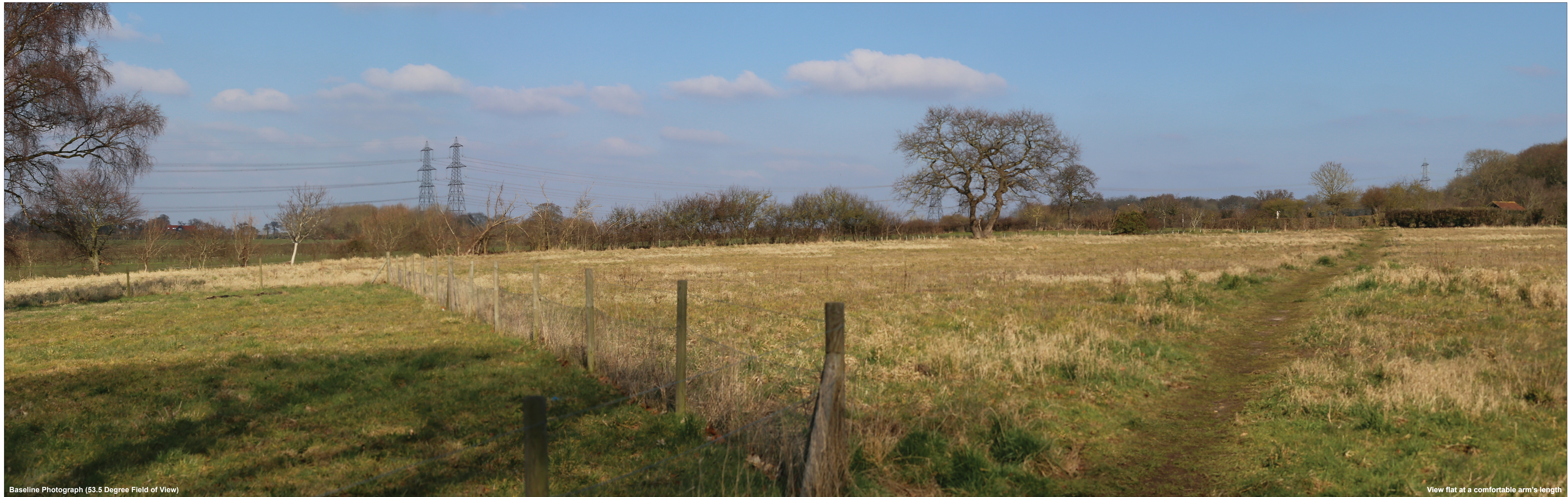
Baseline Photograph (53.5 Degree Field of View)