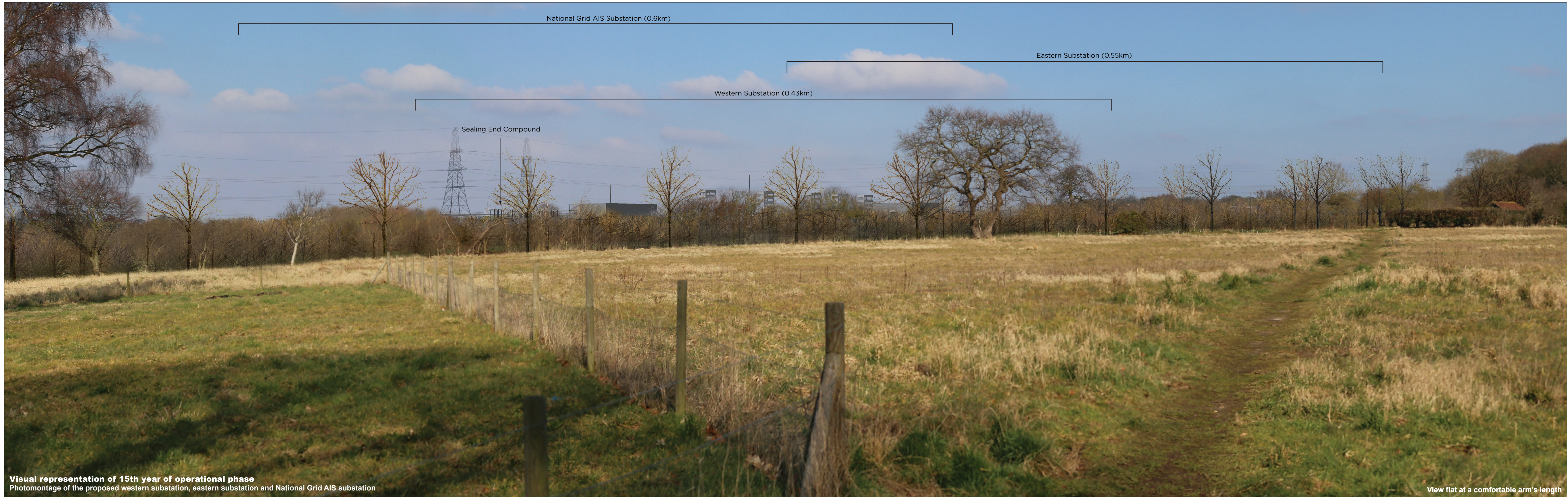
Visual representation of 15th year of operational phase Photomontage of the proposed western substation, eastern substation and National Grid AIS substation