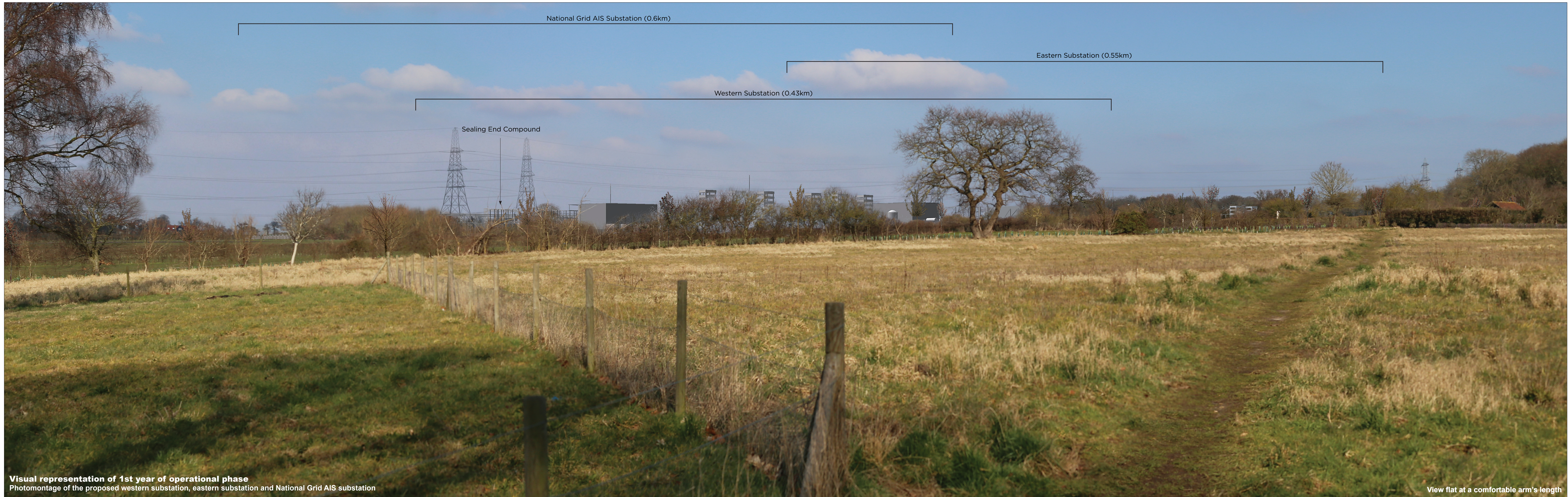
Visual representation of 1st year of operational phase Photomontage of the proposed western substation, eastern substation and National Grid AIS substation